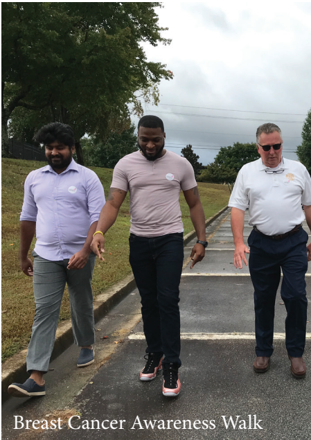
Breast Cancer Awareness Walk