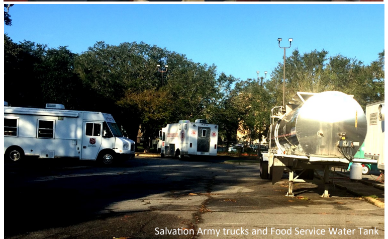
Salvation Army trucks and Food Service Water Tank