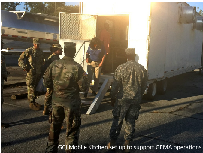
GCI Mobile Kitchen set up to support GEMA operations

The Beyond the Call of Duty award is given in recognition of staff who go over and beyond the requirements of their job responsibilities for the benefit of GCI with a positive attitude and professionalism.